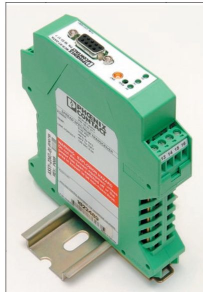
Figure 1. RAD-ISM-900-DATA-BD p/n 2867131