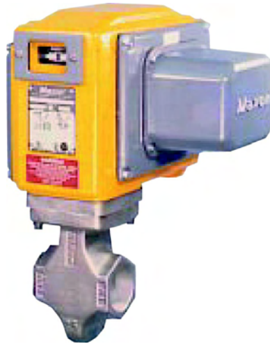
2" Series 5000-CP position "L" with stainless steel body