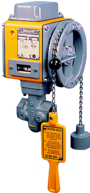
1.25" Series 808 position "R", with wheel & chain assembly