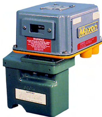
1" Series 8730 position "TO"