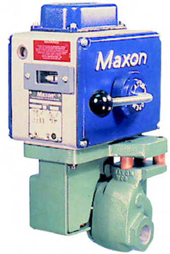
1" Series 760 position "L"