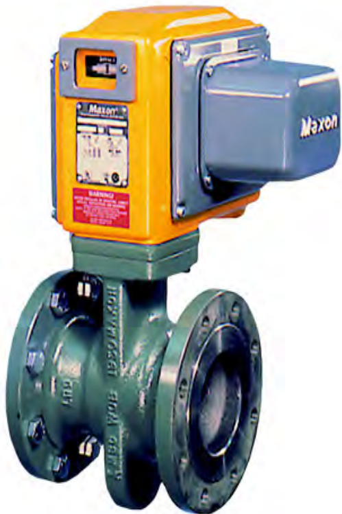
2.5" Series 808 position "TO"