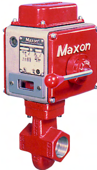
1.5" Series STO-M position "L"