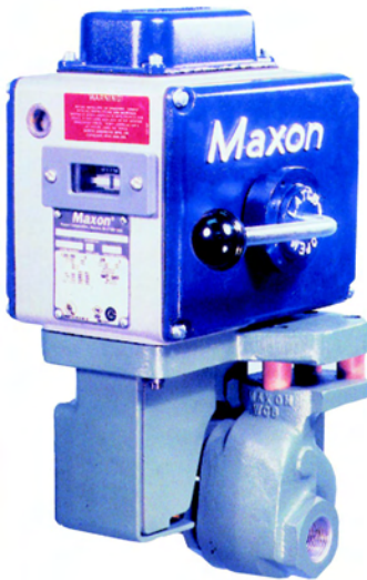
1" Series 23300 position "L"