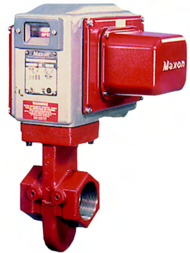
2.5" Series STO-ACP position "R"