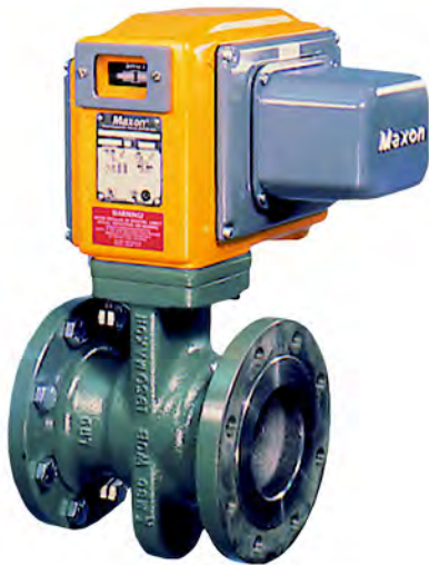
4" Series 5000-SCP position "L"