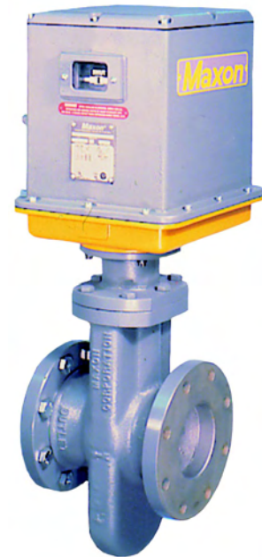
4" Series 7000 position "L"