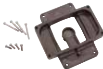
Display Adapter Kit