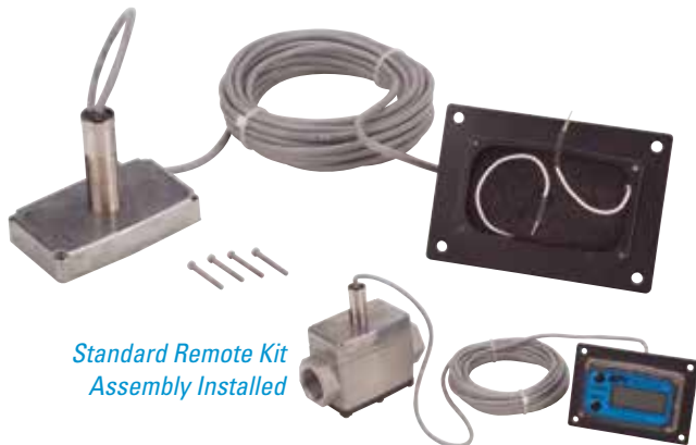
Standard Remote Kit Assembly Installed

The Standard Remote Kit Assembly modifies FLOMEC® Electronic Digital Meters for applications in specialized situations including remote indication and high or low fluid temperature metering applications. This kit also provides the versatility of panel mounting of the LCD readout up to 300 ft. (90 m) from the turbine housing and sensor.