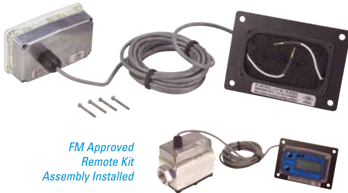
FM Approved Remote Kit Assembly Installed

The Factory Mutual (FM) Approved Remote Kit Assembly modifies FLOMEC® Electronic Digital Meters for applications in specialized situations including remote indication and high or low fluid temperature metering applications. This kit provides the versatility of panel mounting of the LCD readout up to 100 ft. (30 m) from the turbine.