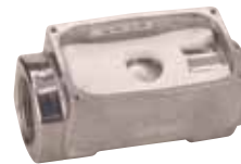
XX No Computer