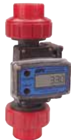
Kit Shown Installed on PVDF Meter

90° Display Adapter Kit allows for horizontal readout of vertical meters. Includes adapter, O-ring, screws and foam spacers required for installation.