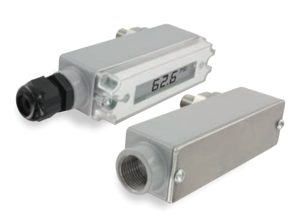
626/628 pressure transmitters with conduit box housing (-CB) and LCD display