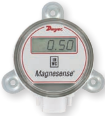
Standard MS with optional LCD