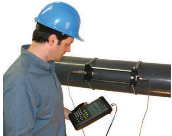
Portable flow meter user

Portable ultrasonic flow meters are designed for short-term survey and monitoring. Typically, they are compact and lightweight and meant to be temporarily installed and moved from site to site. Portables typically include the flow electronics, external components like fixtures, transducers and cables, and accessories such as thickness gages and carrying cases. Because portables are often shared by multiple users and/or used on an irregular basis, ease of use and confidence in the measurement provide unique challenges and opportunities for clamp-on manufacturers.