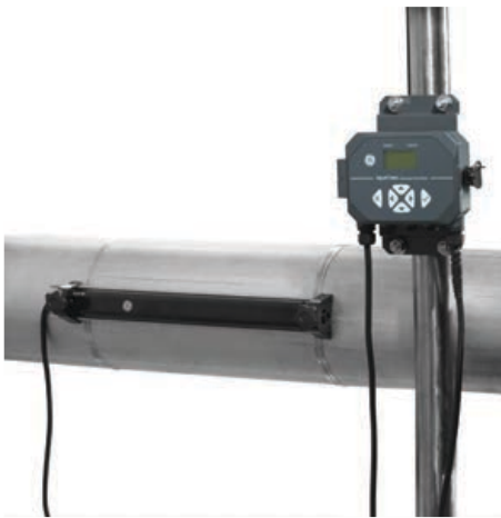
AquaTrans AT600 flow meter

The AquaTrans* AT600 is the latest in the Panametrics line of clamp-on ultrasonic liquid flow meters. It features a user-centered design that focuses on ease of use, cost-efficiency and reliability. The AT600 is installed directly on a pipe in just minutes without shutting down the process and then left in place without maintenance and calibration. It handles a broad range of liquid flow applications like water/wastewater, industrial, HVAC, hydroelectric, and agriculture.