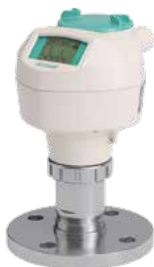
SITRANS LR250 FEA

TFM™ PTFE lens offers extreme corrosion resistance.