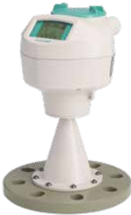
SITRANS LR250 PLA

SITRANS LR250's complete range of antennas and process connections makes this transmitter suitable for nearly any liquids application. Built to last, these antennas give you liquid level flexibility for inventory and process vessels.