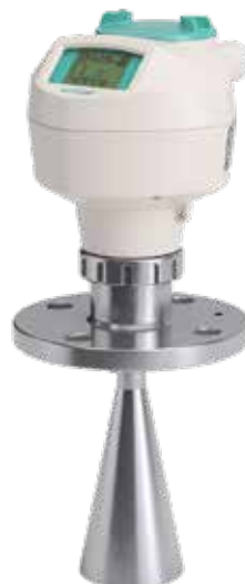
SITRANS LR250 Horn