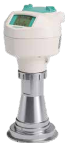
SITRANS LR250 HEA