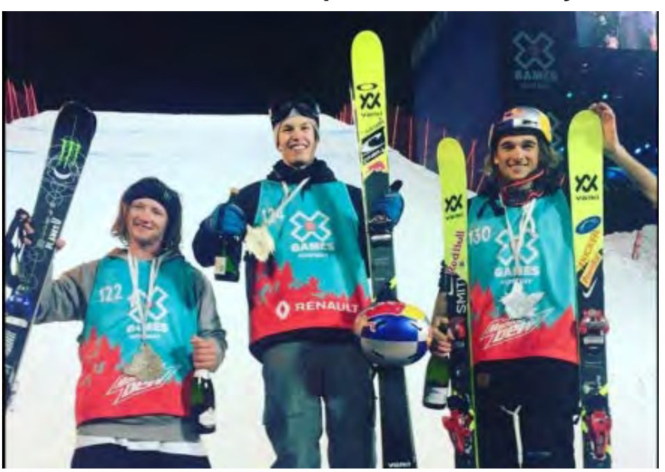
Xgames Norway March 9, 2017 (Silver is second favorite color.)

You Can Finish on the podium with Honeywell!