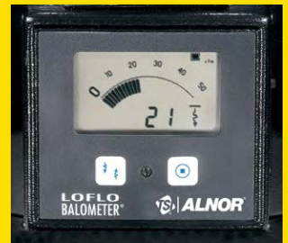
Model 6200D with display detail