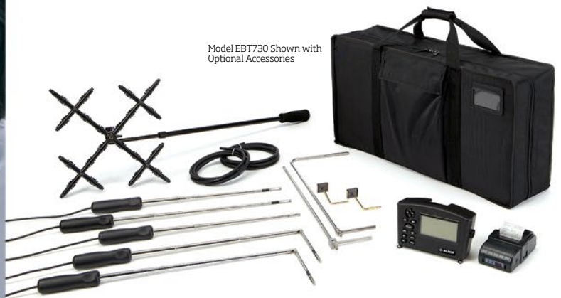
Model EBT730 Shown with Optional Accessories