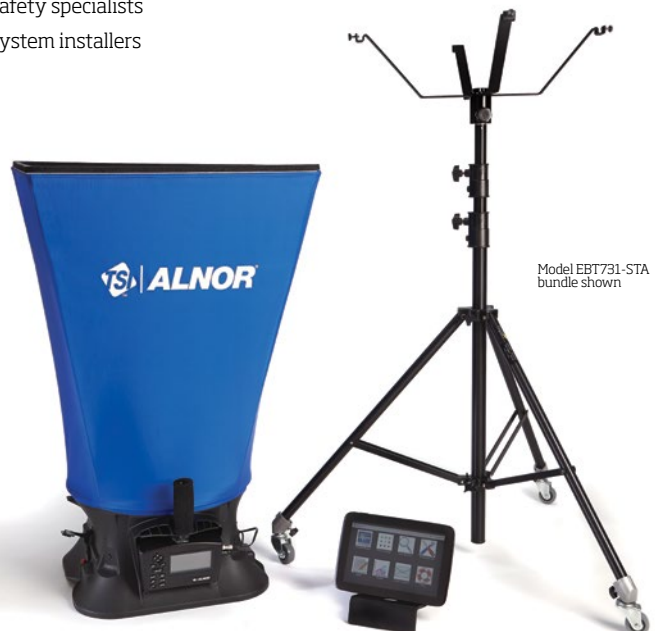
Model EBT731-STA bundle shown

* TSI has the discretion to change the brand and model of tablet at any time.