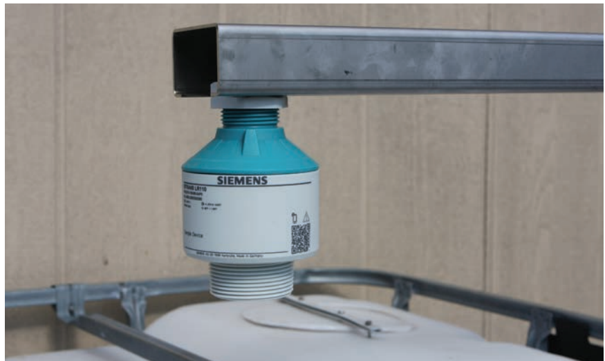
SITRANS LR100 series radar transmitters can monitor through plastics, which means accurate, non-intrusive level measurement of aggressive chemicals in plastic vessels.

Whether it's a result of an instrumentation company's limited portfolio or hyped-up marketing for a shiny new device, a single technology approach is confusing to customers and a source of