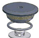
PM 2.5 Impactor