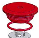
PM 4.0 Impactor