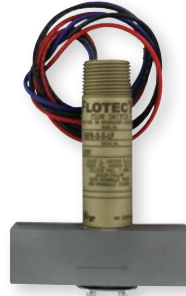
V6 low flow

OVERALL LENGTH WITH 1-1/4" TEE CONNECTION APPROXIMATELY 8" [31.75 to 203.20 MM]