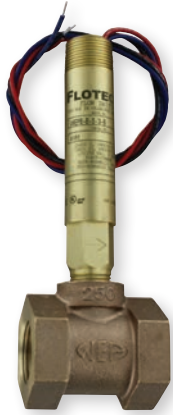
V6 with tee

Monitor Flow in 1/2" to 2" (12.70 to 50.80 mm) Pipe, Explosion-Proof, Compact