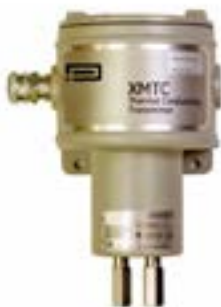
XMTC thermal conductivity gas transmitter