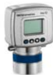
O2X1 galvanic fuel cell oxygen transmitter