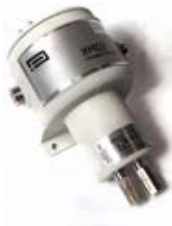
XMO2 thermoparamagnetic oxygen transmitter

The TMO2D provides long-term, hands-off operation with this optional feature. When initiated, the TMO2D controls solenoid valves in the sample system to bring zero and span gases to the transmitter. Then TMO2D software compares the calibration gas readings with factory data to verify proper calibration. If an adjustment is necessary, the TMO2D makes corrections automatically and notifies the user via the front panel display and alarm contacts.