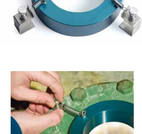
Simple installation. The Phaeton XTL clips on in two minutes or less.