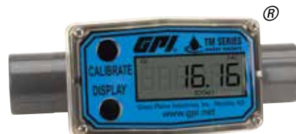
"Look for the blue label!"