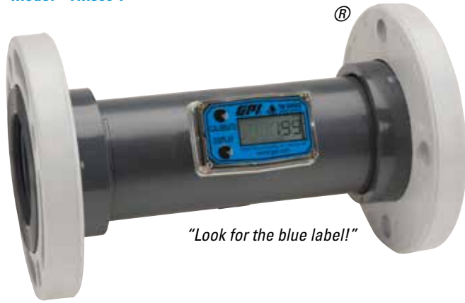
Model - TM300-F