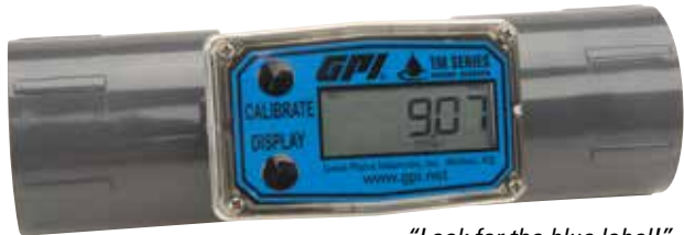
"Look for the blue label!"

TM Series Meters are designed for use in water applications. The five smallest sizes are shown here. (For 3" and 4" meters, see next page.) Choose either Spigot (pipe end) or NPT and BSPP fittings.