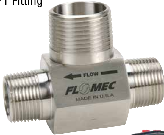
GNT shown here with Local Display