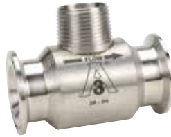
Sanitary Clamp Models