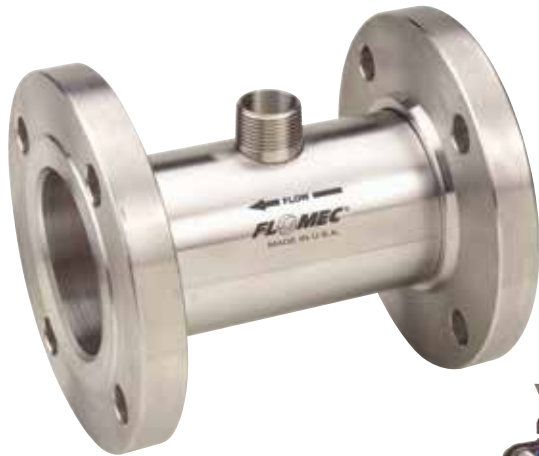
GFT shown here with GX510