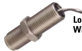
Local Pickup Wire Lead