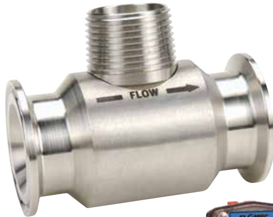
GSCP shown here with Local Display