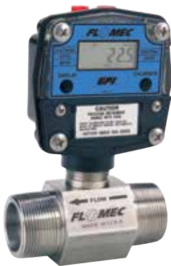
GNP shown here with Local Display

For complete part number, see "Meter Number Reference" for this section.