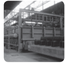
Bogie hearth furnace

At least once a year, twice a year in the case of biologically produced methane.