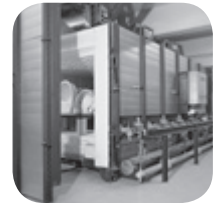
Intermittent shuttle kiln