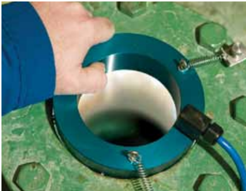
Cool operation eliminates "baked-on" product blocking the window.