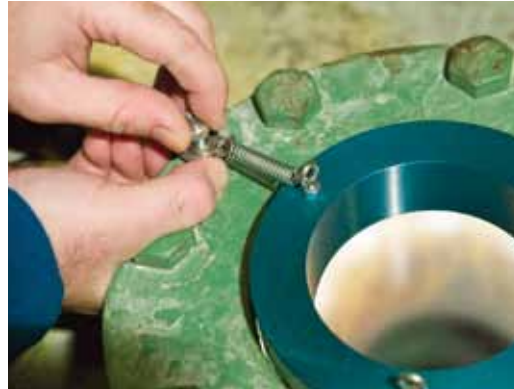
Simple installation. The Phaeton XTL clips on in two minutes or less.