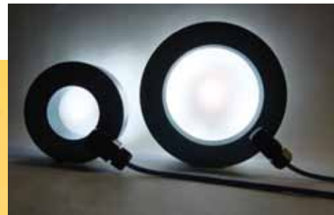
Intrinsically Safe LED Tank Lights XTL Series