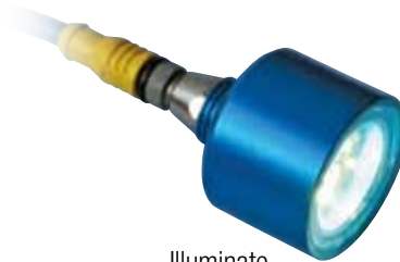
Illuminate units as small as 1/4" with the Phaeton SL.