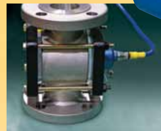
Intrinsically Safe LED Sight Flow Indicator Lights SL Series