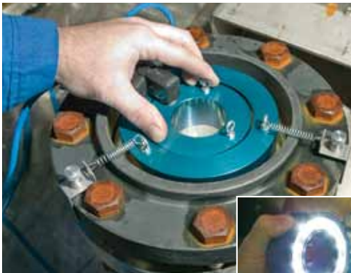
Double the brilliance by simply placing a 4" Phaeton XTL inside a 6" Phaeton XTL.