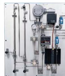
Moisture analysis in high pressure natural gas. Dual coalescing filters with bypass flow to remove TEG from sample gas. It can be coalesced out of sample, providing reliable sensor performance.