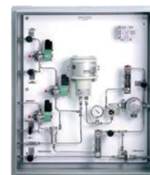
Thermoparamagnetic process oxygen analysis of a low pressure application with remote selection of sample, purge, and calibration gases.

Call 800-953-7626 for pricing and customizations!